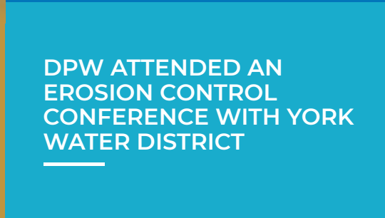
DPW ATTENDED AN EROSION CONTROL CONFERENCE WITH YORK WATER DISTRICT