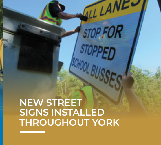
NEW STREET SIGNS INSTALLED THROUGHOUT YORK