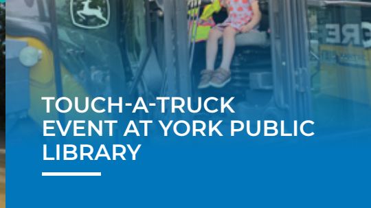
TOUCH-A-TRUCK EVENT AT YORK PUBLIC LIBRARY

New asphalt road surfaces and paving was completed on Earline Circle, Graystone Lane, Candlewood Lane, Algonquin Drive, Little River Drive, Storage Drive, Whipoorwill Ridge.