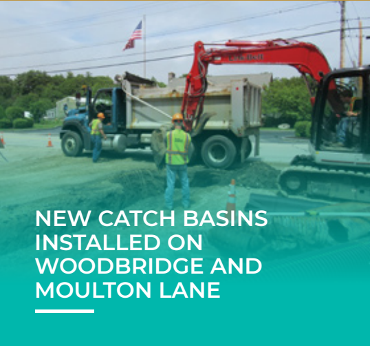
NEW CATCH BASINS INSTALLED ON WOODBRIDGE AND MOULTON LANE