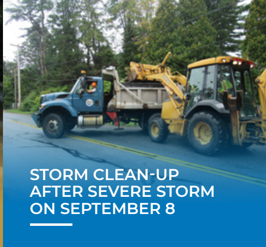
STORM CLEAN-UP AFTER SEVERE STORM ON SEPTEMBER 8