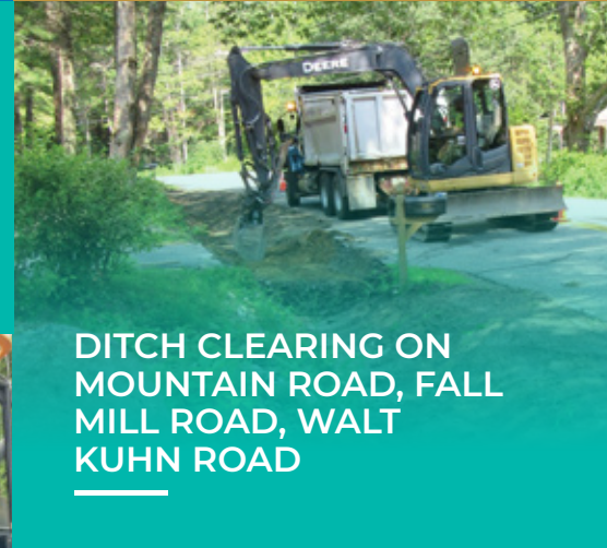
DITCH CLEARING ON MOUNTAIN ROAD, FALL MILL ROAD, WALT KUHN ROAD