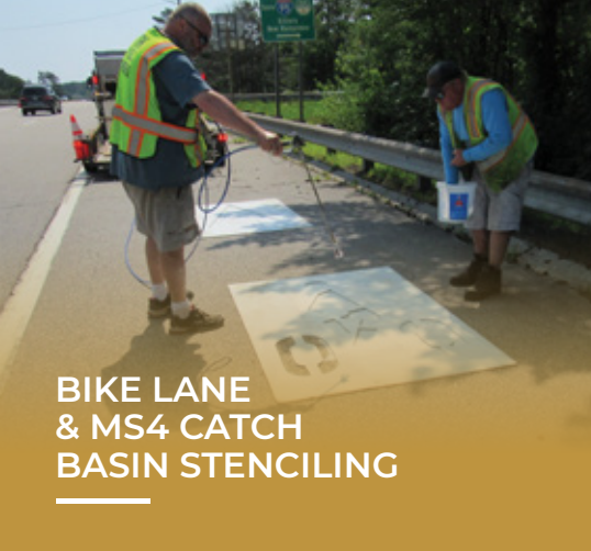
BIKE LANE & MS4 CATCH BASIN STENCILING